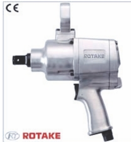
RT-5662 ( 1 )