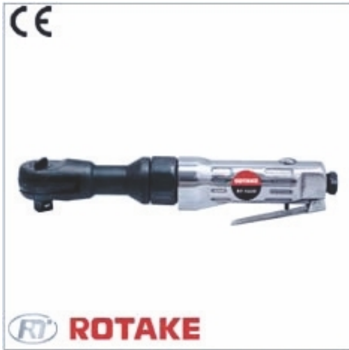
RT-5220 ( 1/2 )