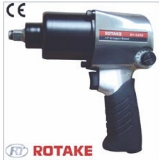
RT-5268 ( 1/2 )