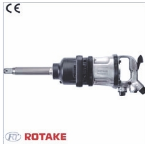
RT-5880 ( 1 )