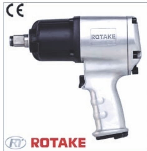
RT-5560 ( 3/4 )