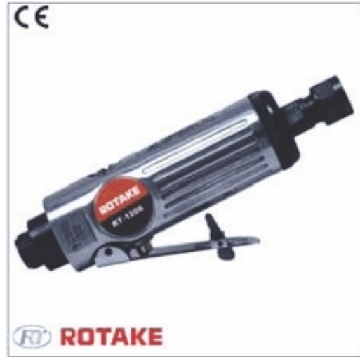
RT-1206 (22000 / )