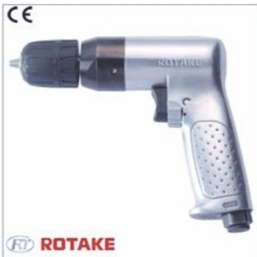
RT-3802 (Сверло 10 мм)