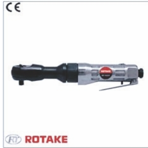
RT-5221 ( 3/8 )