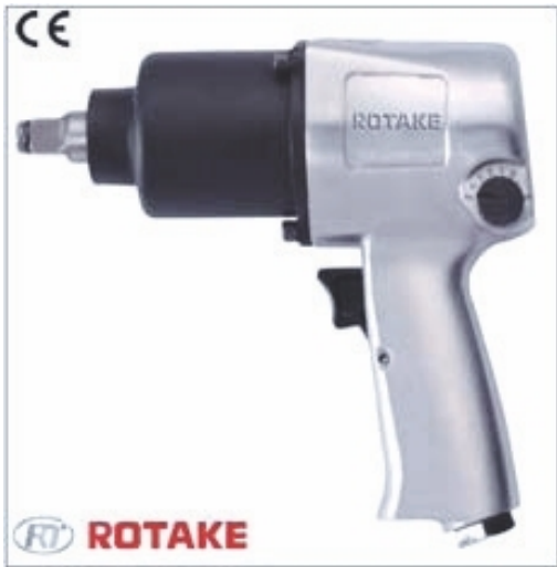
RT-5231 ( 1/2 )