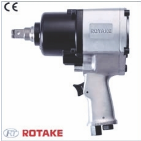
RT-5562 ( 3/4 )