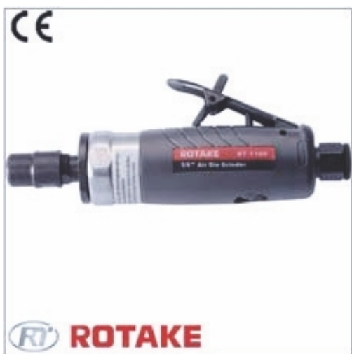
RT-1108 (25000 / )