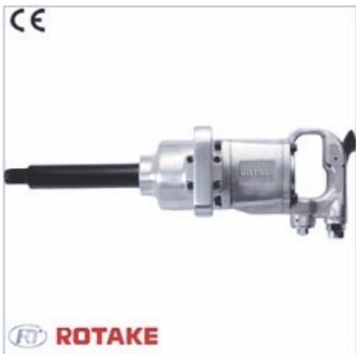
RT-5660 ( 1 )