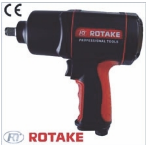
RT-5273 ( 1/2 )